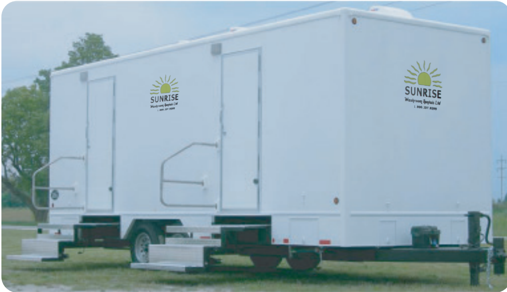
*May not be exactly as shown