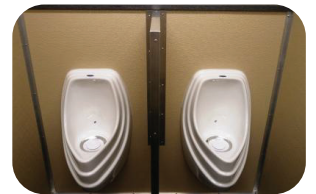
*May not be exactly as shown