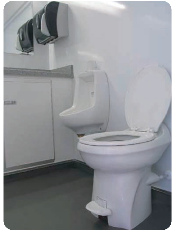
*May not be exactly as shown