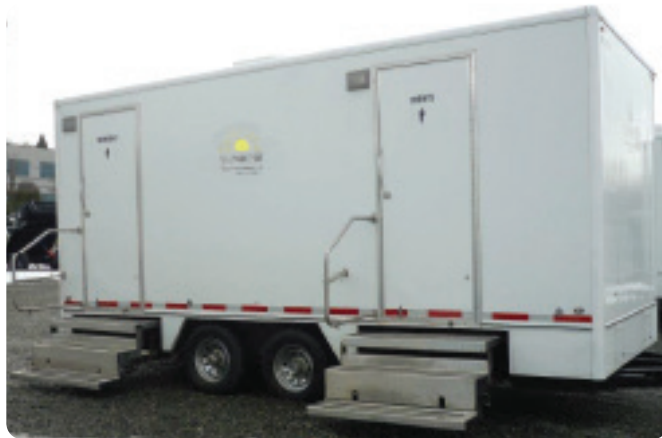
*May not be exactly as shown